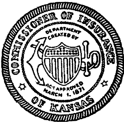
Kathleen Sebelius Commissioner of Insurance

IT IS SO ORDERED THIS 28th DAY OF JUNE, 2000 IN THE CITY OF TOPEKA, COUNTY OF SHAWNEE, STATE OF KANSAS.